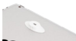
Adhesive security slot T-LOCK