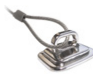
Anchor point for desk or wall mounting