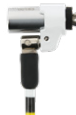
Security cable slim pivoting head, with key lock, in steel, WEDGE® SLOT

Ref. 001328 Pass Key** compatible: 001329