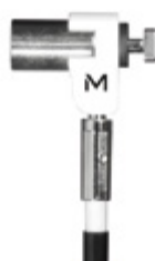
Security cable slim pivoting head, with key lock, in steel, T LOCK SLOT

Ref. 001111 Pass Key** compatible : 001236