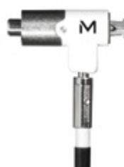
Security cable slim pivoting head, with key lock, in steel, NANO SLOT

Ref. 001325 Pass Key** compatible: 001326