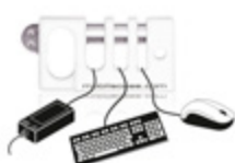
Cable collector for up to 3 devices