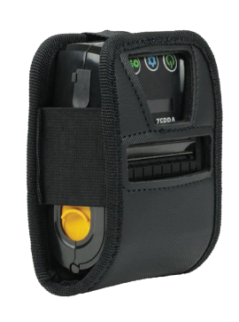
For mobile printers