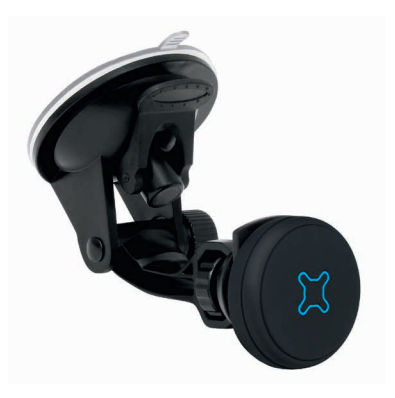
MAGNETIC MOUNT FOR WINDSCREEN