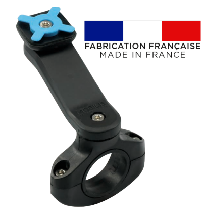
U.FIX UNIVERSAL MOUNT MADE IN FRANCE Ref. 044019