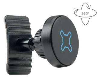
UNIVERSAL U.FIX ROTATING MINI TO STICK