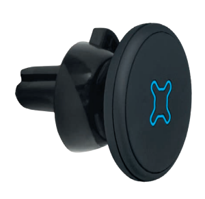
MAGNETIC MOUNT AIR VENT Ref. 044004