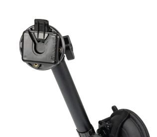
Ref. 001296 SecureClip suction with cup holder Ø 90mm - M