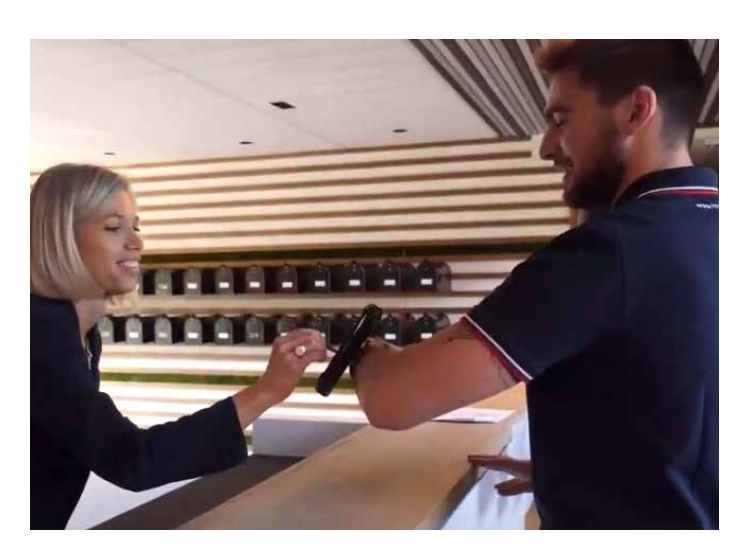
TRANSPORT & LOGISTICS