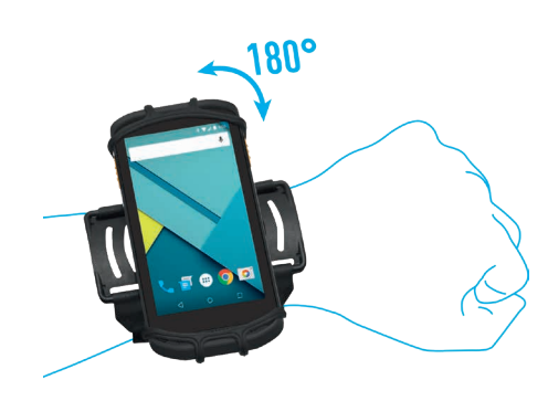
WEARABLE ARM BAND

Universal wrist/arm band for smartphone and handheld device Ref. 4-6": 030003 Ref. 5-7": 030004