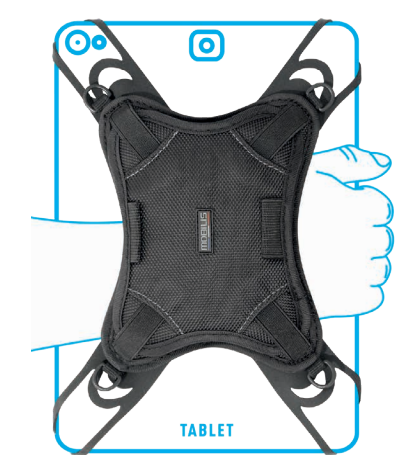
UTILITY HANDLE & stylus straps for tablet

Universal wrist/arm band for smartphone and handheld device Ref. 4-6": 030003 Ref. 5-7": 030004