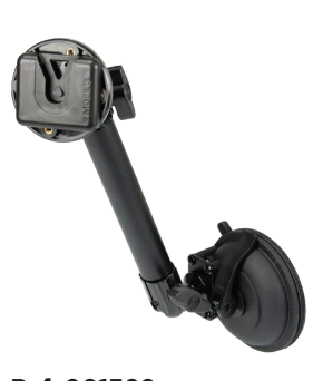
Ref. 001302 SecureClip suction with cup holder \varnothing 90mm - M