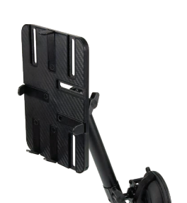
Ref. 001308 Tablet Holder 7-11" with suction cup \varnothing 90mm - \mathbf{M}