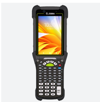
SCREEN PROTECTOR Ref. 036325