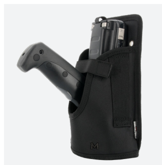
HOLSTER Ref. 031004