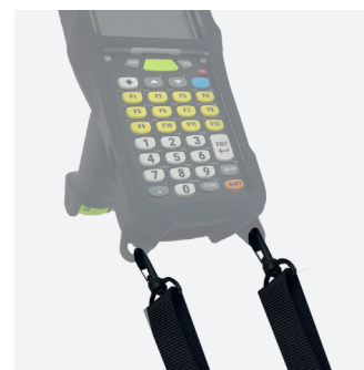
BASIC SHOULDER STRAP 2 attachment points Ref. 001093