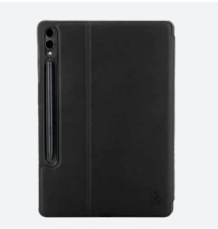
Compatible magnetic system