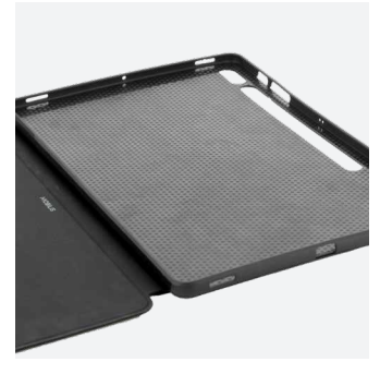
Flexible TPU case