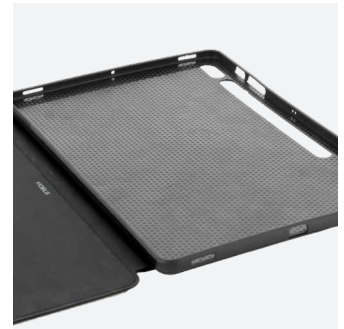
Flexible TPU case