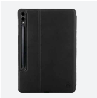
Compatible magnetic system for the stylus