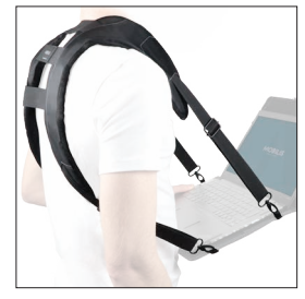
001026 Harness ergonomic 4 attachment points