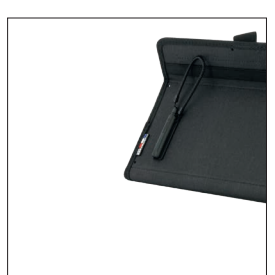
001080 - Pack of 10 Adhesive Stylus Holder with universal capacitive stylus and spiral cord 001059 Only adhesive stylus holder.