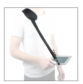
001048 Basic shoulder strap with 4 soft rings 2 attachment points