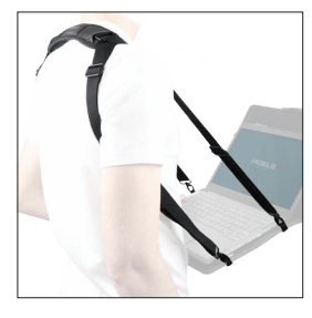
001024 Typing and transport shoulder strap 4 attachment point