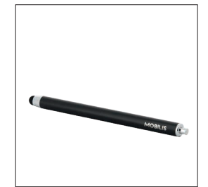
001053 Capacitive stylus per unit