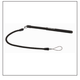
001030 - Pack of 10 Retractable capacitive styluses & spiral cord