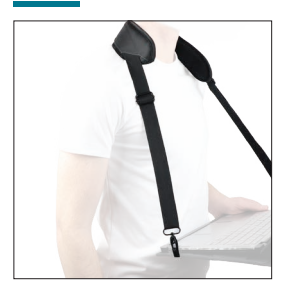
001025 Ergonomic shoulder strap with neck pad 2 attachment points