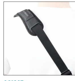
001027 Shoulder strap with break away system 2 attachment points