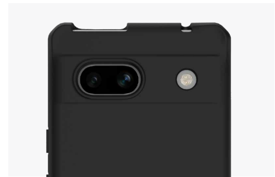
Protect your screen and camera lens