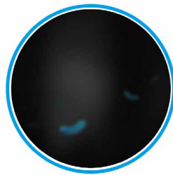
Impactthane protected after 2 hours Up to 99% microbes killed