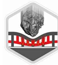
Adding resistance on impact with the second layer

Using air as a mattress to absorb the shocks, the honeycomb - design micro air pockets now have an extra layer that enables a 2 Step resistance against Kinetic energy generated if you drop your phone.