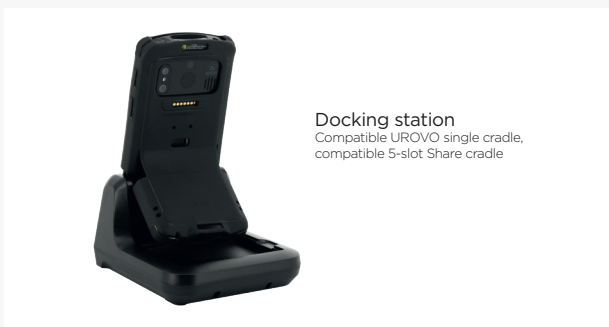
Docking station Compatible UROVO single cradle, compatible 5-slot Share cradle