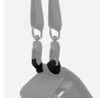
Shoulder strap included with two attachment points