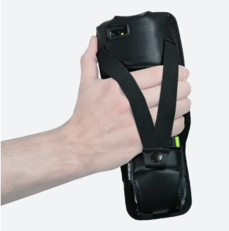
Elastic hand strap