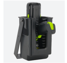
Holster Forklift Ref. 031023