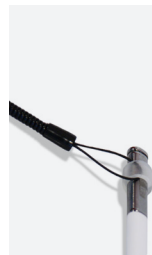
Pack of 10 spiral cords for stylus with elastic tube Ref. 001033