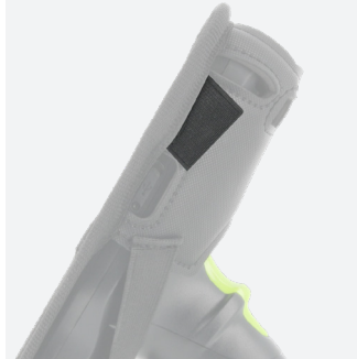
Stylus not included