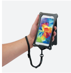
Pack de 10 dragonnes Réf. 001036