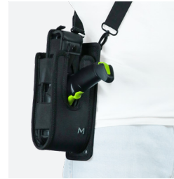
Holster M Pistol Grip + Belt + Legstrap Ref. 031011