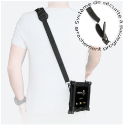
Safety carry shoulder strap 2 attachment points Ref. 001027