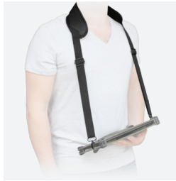
Ergo shoulder strap - 2 attachment points. Ideal for transport and occasional typing Ref. 001025