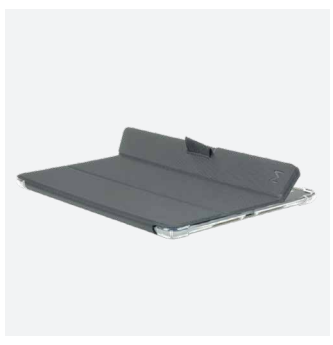
Automatic sleep & wake mode