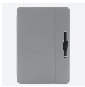
Stylus not included