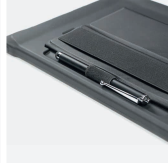
*Stylus not included