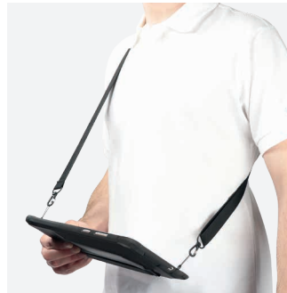
For typing in standing position