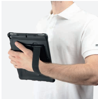
Portrait / Landscape layout