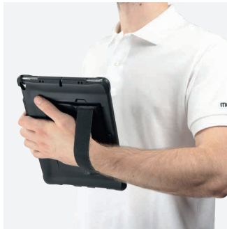
Portrait / Landscape layout