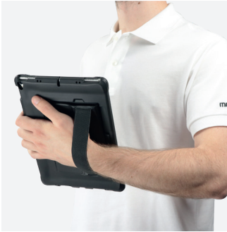
Portrait / Landscape layout