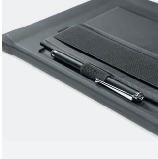
*Stylus not included