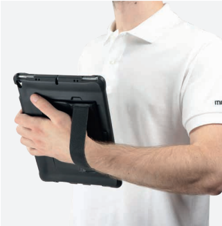
Portrait / Landscape layout