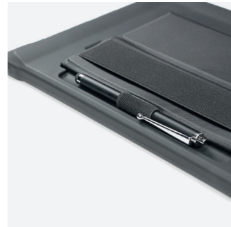
*Stylus not included