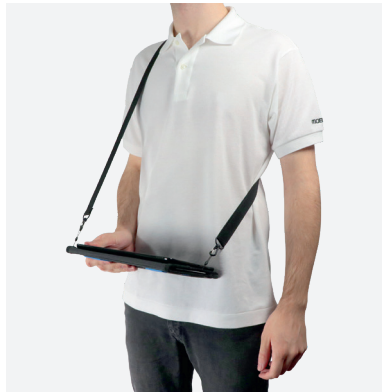
For typing in standing position