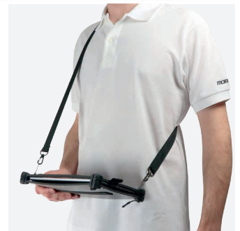
For typing in standing position