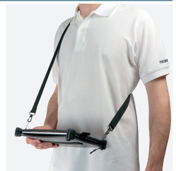
For typing in standing position