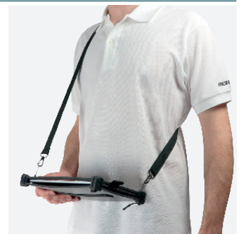
For typing in standing position