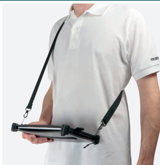
For typing in standing position

+ Shoulder strap attachment rings : Braided nylon, resistant to a 15kg traction per ring