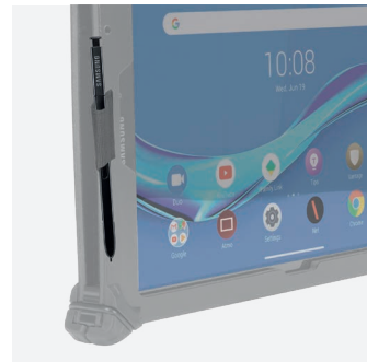
Stylus not included