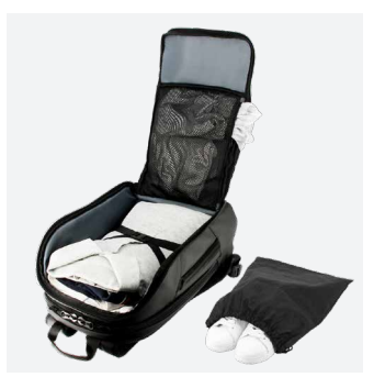
With pockets for personal belongings, elastic straps to hold clothes and storage bag.