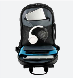
Reinforced laptop pocket + 1 tablet storage pocket + 1 mesh pocket for accessories.