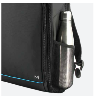
1 side mesh pocket to easy access for a bottle / umbrella....