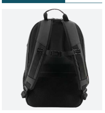
Chest strap, ergonomic shoulder straps and padded back.