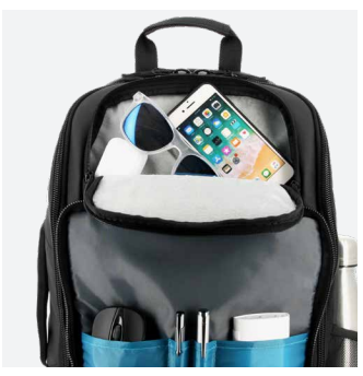
Anti-scratch fleece inner lining for glasses or accessories.