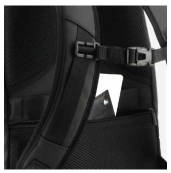
1 secret back pocket for valuable personal items (passport, wallet,