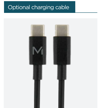
Cable USB-A > USB-C (Ref. 001278) USB-C > USB-C (Ref. 001342)