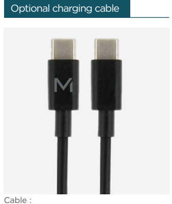
USB-A > USB-C (Ref. 001278) USB-C > USB-C (Ref. 001342)